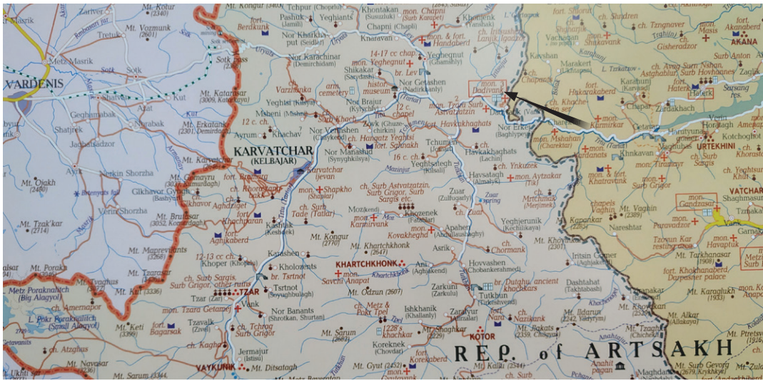
Figure 4. Dadivank Monastery, Artsakh

The monastery gained significant landholdings during the following centuries which included areas now in the Karvachar (presently under occupation of the Republic of Azerbaijan), Vardenis (Republic of Armenia) and Martakert regions (Artsakh). There were no monks or functionaries, however, in the monastery from the end of the 18th to the beginning of the 19th centuries. The villages belonging to the monastery were completely denuded of inhabitants at the end of the 18th century as a result of Agha Mahmed's 32 incursion and the plague and famine that followed it. This was followed by the settlement in the area of Kurds of the Qolani tribe that arrived from the khanate of Yerevan. 33 Other Kurdish tribes also settled in the region during the following decades, as well as ayurums [tribe in the Caucasus]. 34 Metropolitan (Bishop) Baghdasar Hasan-Jalalyan 35 made attempts, after the khanate of Karabagh became part of Russia in 1813, to recover lands owned by the monastery. During his prelacy, at his suggestion and with the intercession of the Catholicos of All Armenians Nerses V, 36 viceroys of the Caucasus Mikhail Vorontsov