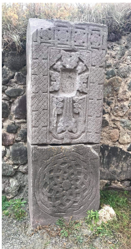
Figure 5. The two deliberately cut parts of Dadivank's khachkar (1182), which were established by Hasan Vakhtangyan

arranged to have an investigation carried out and land with an area of 196,438 dessiatins [a dessiatin is equal to 1.09 hectare] was returned to the monastery. However, over time, some of it became disputed, and the monastery's ownership of some areas shrank. 37