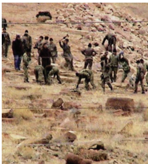
Figure 14. Azerbaijani Soldiers Destroying Armenian Gravestones in Jugha, Nakhijevan in 2005