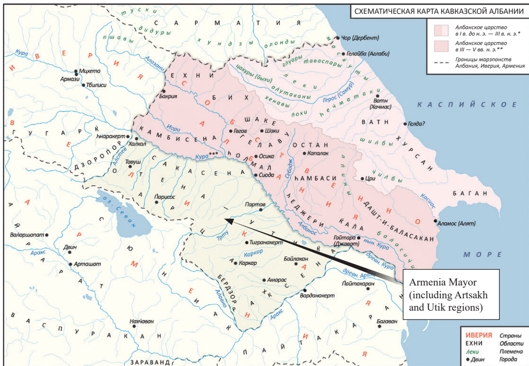
Figure 9. Caucasian Albania and Armenian Artsakh and Utik regions