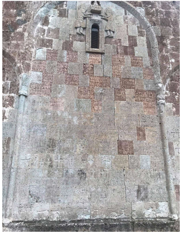
Figure 7. Armenian inscriptions (13th century) of the [Katoghike] Church of Dadivank Monastery

A letter was sent to the department of the printing house of the Mother See of Echmiadzin, dated 23 October 1912 and addressed to Catholicos Gevorg V, 40 requesting that he orders copies of the necessary church books to be sent to the Armenian population of the land belonging to the monastery of Khota which was under Echmiatsin's jurisdiction. 41