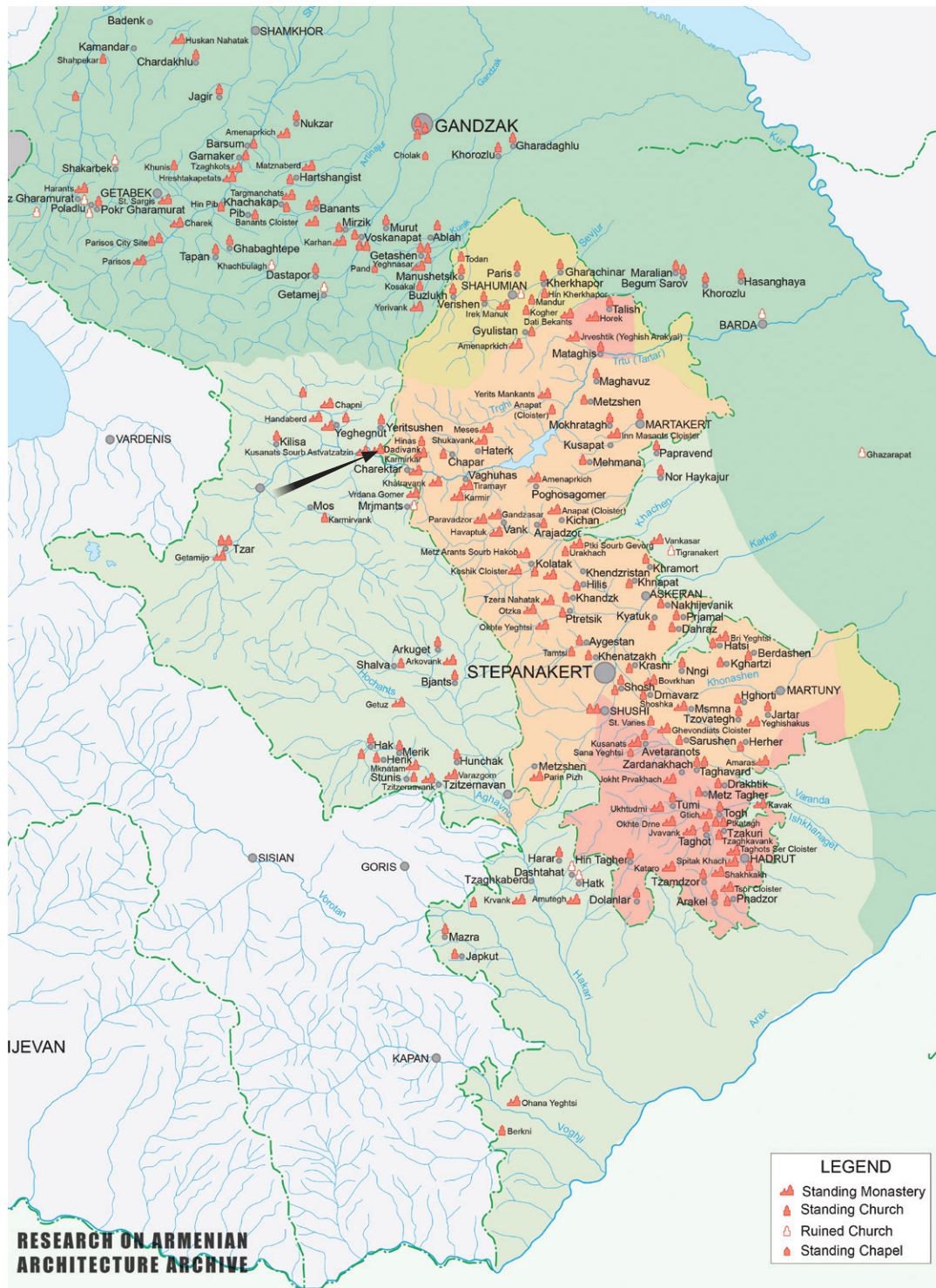
Figure 3. Historical Religious Monuments of Artsakh