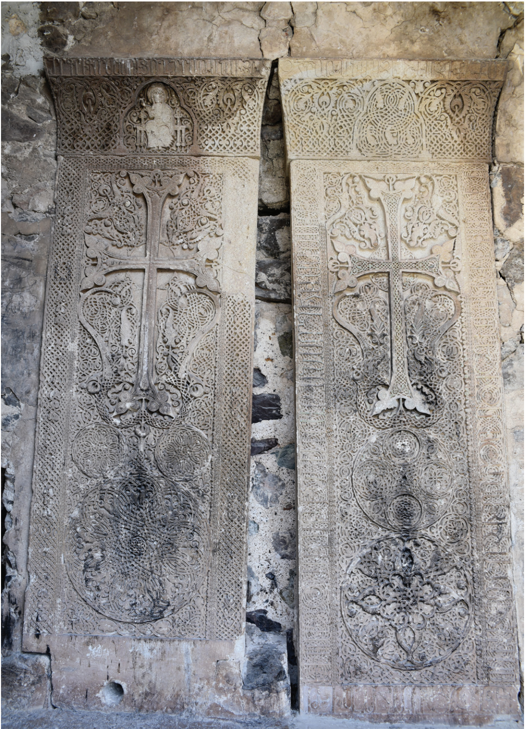
Figure 8. The two khachkars (1283) of the Bell Tower of Dadivank