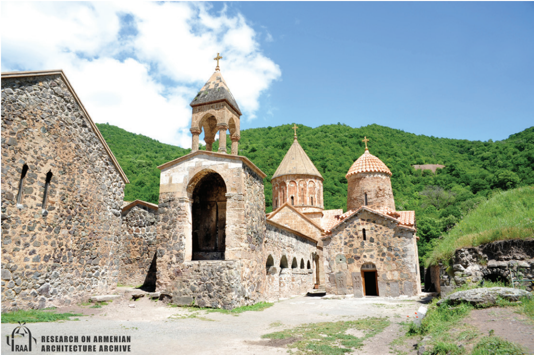
Figure 2. Dadivank Monastery in Artsakh