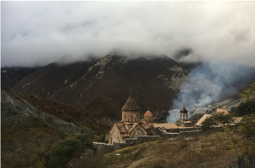
Figure 1. Dadivank Monastery in Artsakh