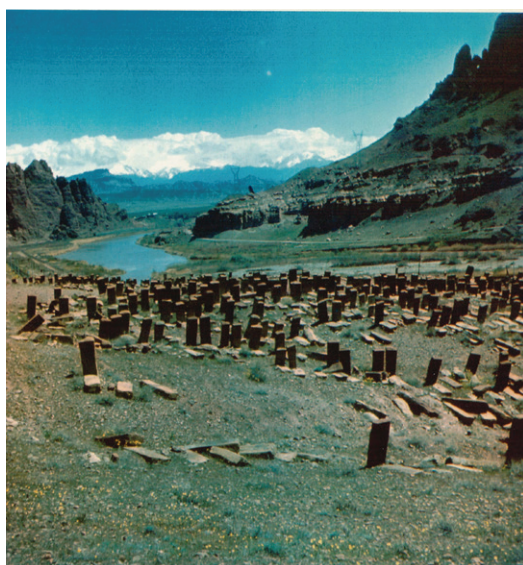
Figure 13. Armenian Medieval Gravestones in Jugha, Nakhijevan (Azerbaijan)